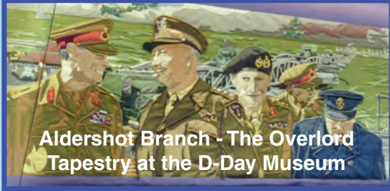
Aldershot Branch - The Overlord Tapestry at the D-Day Museum