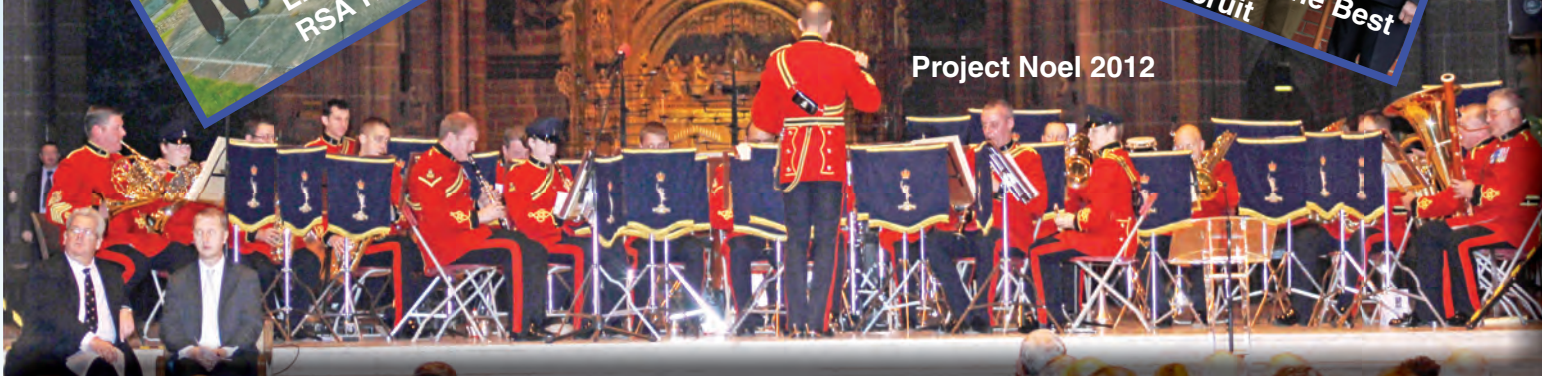
Project Noel 2012