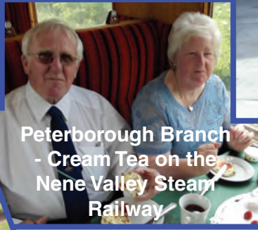
Peterborough Branch - Cream Tea on the Nene Valley Steam Railway