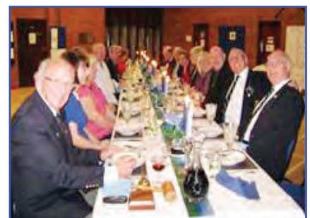
Members of the branch at the Annual Dinner

Middlesbrough Branch. It has been quite a busy year for us; on the evening of Saturday 7 April we held our Annual Dinner Night at the TAC Coulby Newham. This was well attended by the members and their guests. On Sunday 15 April the Chairman and Hon Sec were invited to attend a lunch put on by the TA Signal Troop at the TAC Hartlepool along with members of the Darlington, Spennymoor and Hartlepool Branches of the RSA. Then on Sunday 26 August we were invited by Hartlepool Branch along with other Branches of Area 1 (North) to an area get together at the Pavilion Cricket Club in Peterlee and a great time was had by all attending.