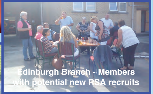
Edinburgh Branch - Members with potential new RSA recruits