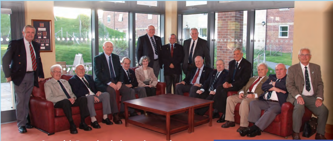
Catterick Branch - their 700th meeting