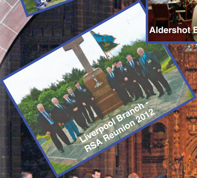
Liverpool Branch - RSA Reunion 2012