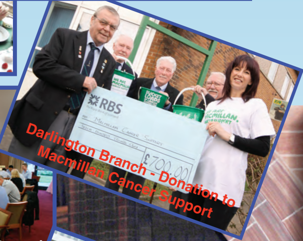
Darlington Branch - Donation to Macmillan Cancer Support