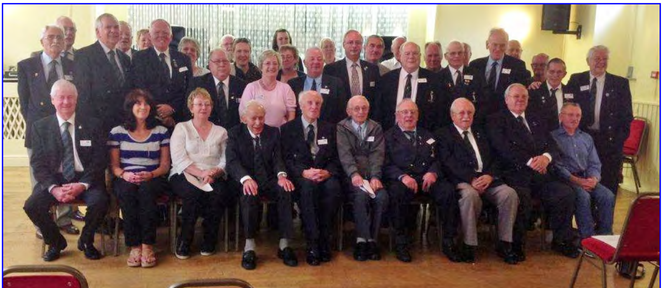
After the AGM in 2012