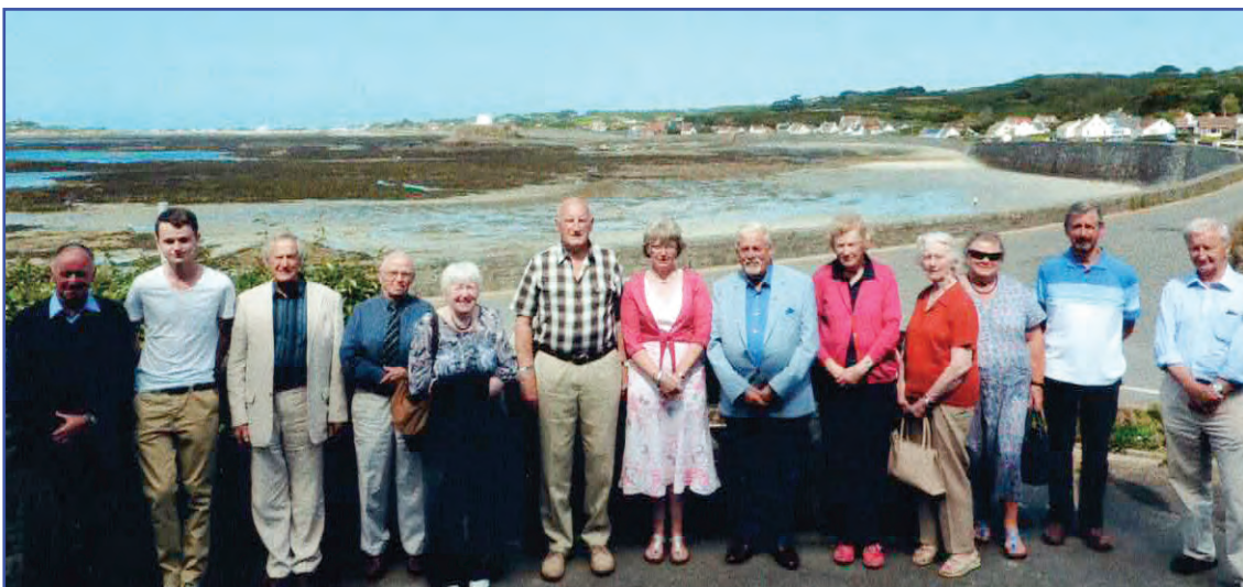
The RSA Admin Officer with members of the Guernsey Branch during a recent visit