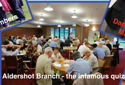
Aldershot Branch - the infamous quiz