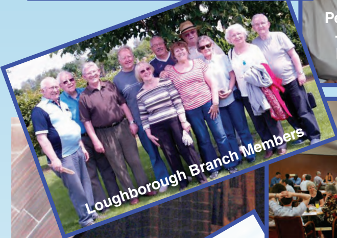
Loughborough Branch Members