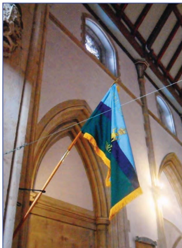
The Torbay Standard in-situ in St Mary the Virgin